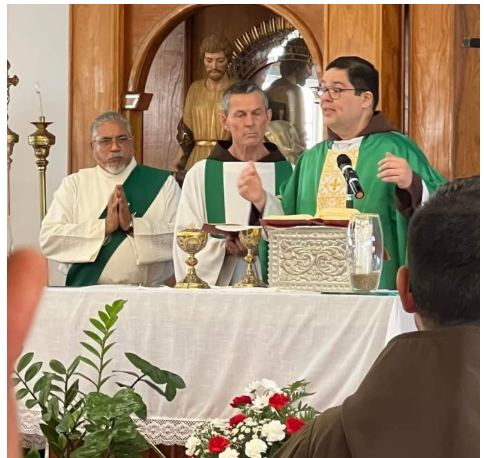
[above] Mass at Iglesia de la Sagrada Familia