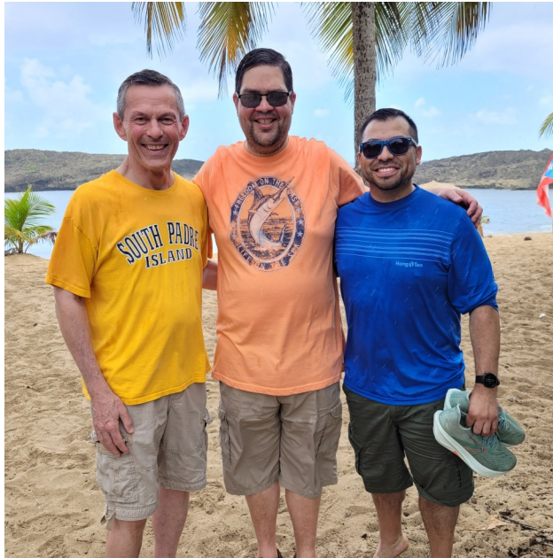
[above] putting in some hard work at La Playa Más Chiquita

A Capuchin Ministry where we see ourselves as more than a church: We are a family!