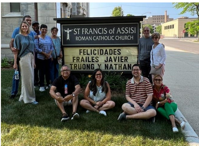
The good folks from Puerto Rico!