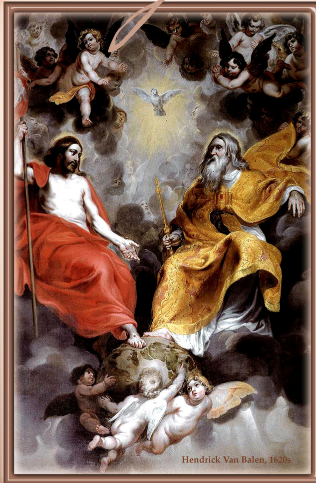
Hendrick Van Balen, 1620s

For God did not send his Son into the world to condemn the world, but that the world might be saved through him.